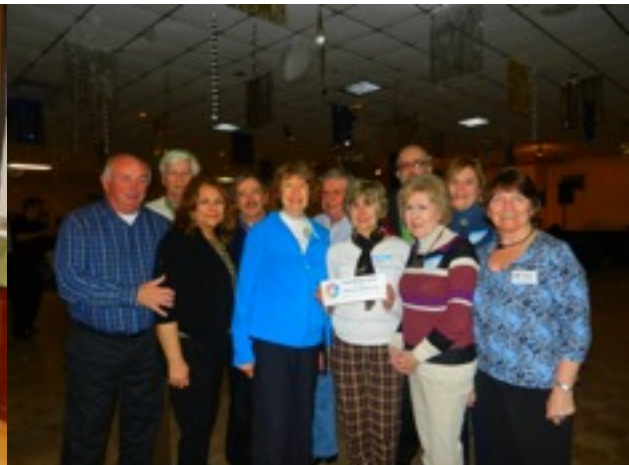
Dancers at Blob's Park