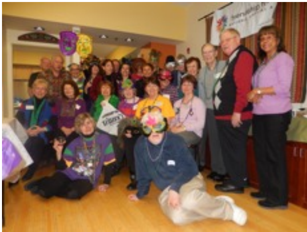
Winter Mardi Gras Dinner