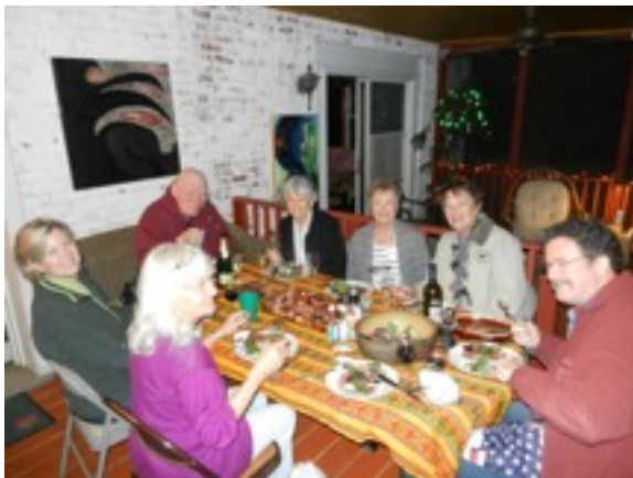
Dinner during inbound exchange from Fort Worth, Texas